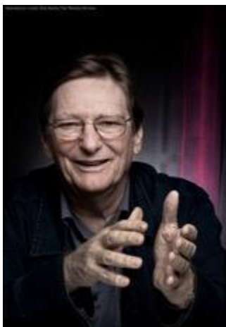
FRED SCHEPISI DIRECTOR

Born in Milan, Italian Australian actor Greta Scacchi studied at the Bristol Old Vic Theatre School before beginning a robust career on stage and screen with early performances in films including Heat & Dust (1983). She went on to international and multi-lingual success in The Coca-Cola Kid (1985), Burke & Wills (1985), White Mischief (1987), Three Sisters (1988), Presumed Innocent (1990), Fires Within (1991), The Player (1992), The Browning Version (1994), Tenerezza (2017), and Looking for Alibrandi (2000), for which she won a Best Supporting Actor Award from the Australian Film Institute. Most recently, Scacchi appears in Rachel Ward's Palm Beach (2019).