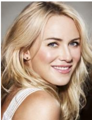
NAOMI WATTS ACTOR

Born in Sydney, Jack Thompson is one of Australia's best-loved actors. He has appeared in numerous films, among them Sunday Too Far Away (1975), The Chant of Jimmie Blacksmith (1978), 'Breaker' Morant (1980), for which he won a Best Actor Award from the Australian Film Institute. Other credits include The Man from Snowy River (1982), Merry Christmas Mr. Lawrence (1983), Midnight in the Garden of Good and Evil (1997), Australia (2008), and, most recently, Don't Tell (2018), for which he was nominated as best actor at the AACTA Awards. He was made a Member of the Order of Australia in 1986.