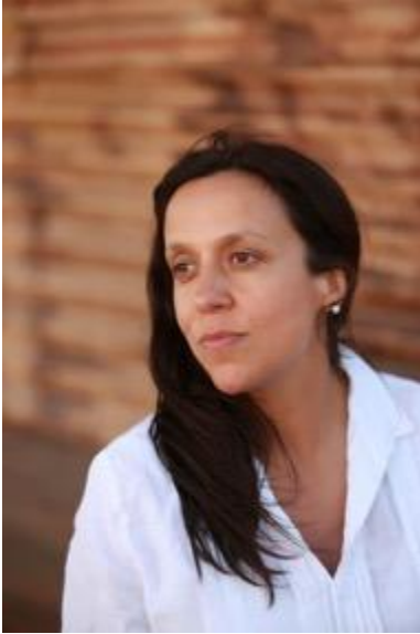
RACHEL PERKINS DIRECTOR, PRODUCER

Rachel Perkins was born in Canberra, and lives between Sydney and Alice Springs, in the ancestral land of her people, the Arrernte Nation. A director, screenwriter, and producer, much of her work explores the Aboriginal experience in Australia. In 1992, Perkins founded Blackfella Films, one of Australia's leading independent production houses. Her feature-length films are Radiance (1998), One Night the Moon (2001), Bran Nue Dae (2010), Mabo (2012), and Jasper Jones (2017), and she has directed television series including First Australians (2008), Mystery Road (2018), and, most recently, Total Control (2019), which is nominated for several AACTA Awards.