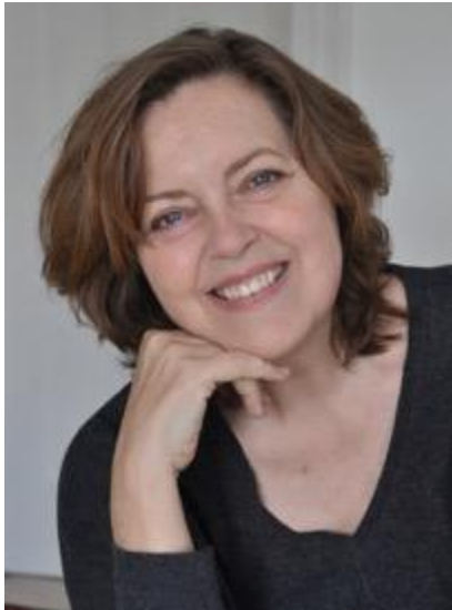
GRETA SCACCHI ACTOR

Born in Milan, Italian Australian actor Greta Scacchi studied at the Bristol Old Vic Theatre School before beginning a robust career on stage and screen with early performances in films including Heat & Dust (1983). She went on to international and multi-lingual success in The Coca-Cola Kid (1985), Burke & Wills (1985), White Mischief (1987), Three Sisters (1988), Presumed Innocent (1990), Fires Within (1991), The Player (1992), The Browning Version (1994), Tenerezza (2017), and Looking for Alibrandi (2000), for which she won a Best Supporting Actor Award from the Australian Film Institute. Most recently, Scacchi appears in Rachel Ward's Palm Beach (2019).