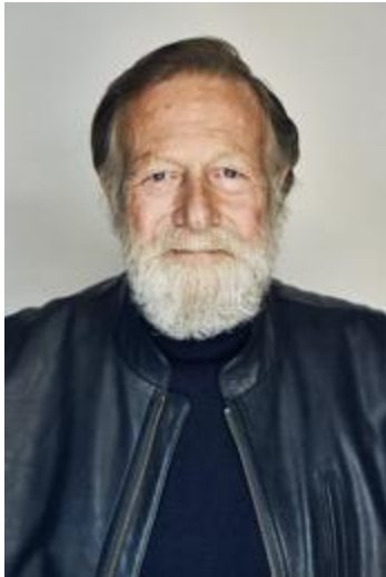
JACK THOMPSON ACTOR

Born in Sydney, Jack Thompson is one of Australia's best-loved actors. He has appeared in numerous films, among them Sunday Too Far Away (1975), The Chant of Jimmie Blacksmith (1978), 'Breaker' Morant (1980), for which he won a Best Actor Award from the Australian Film Institute. Other credits include The Man from Snowy River (1982), Merry Christmas Mr. Lawrence (1983), Midnight in the Garden of Good and Evil (1997), Australia (2008), and, most recently, Don't Tell (2018), for which he was nominated as best actor at the AACTA Awards. He was made a Member of the Order of Australia in 1986.